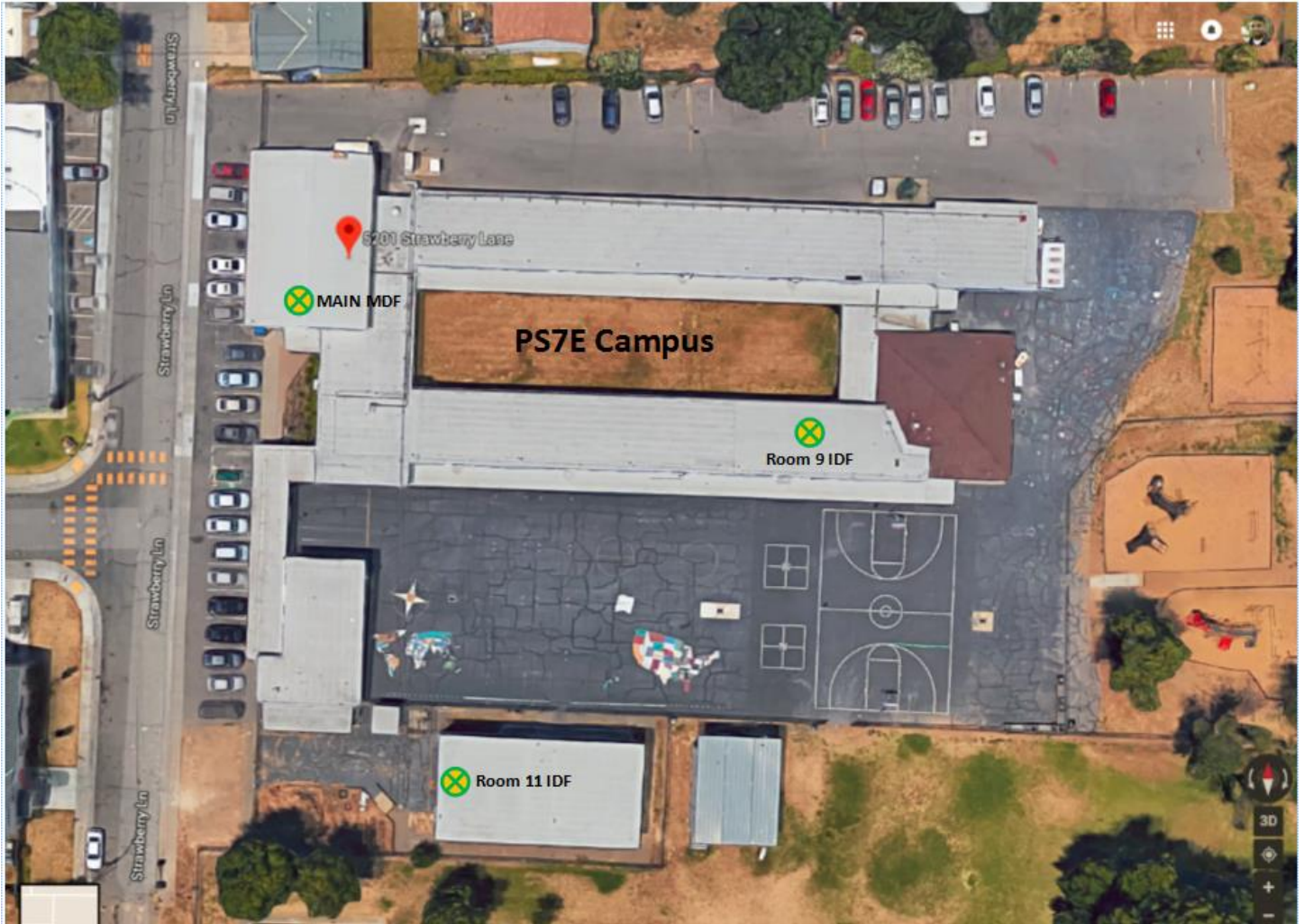
Diagram 1 – MDF and IDF Locations at PS7 Elementary Campus