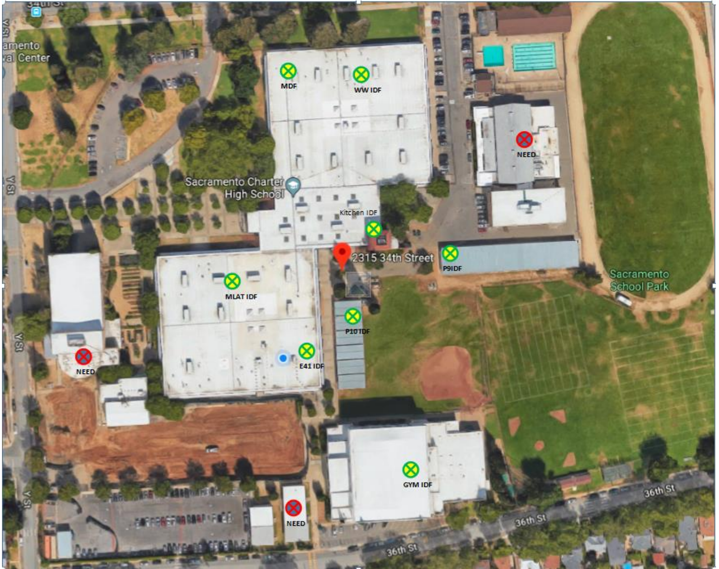
Diagram 2 – MDF and IDF Locations at Sacramento High School Campus