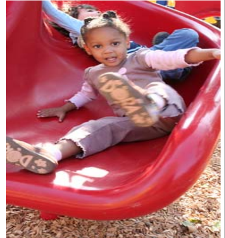
A Triumph student enjoys her play time on the big slide.

On September 4, 2007, St. HOPE Public Schools and UC Davis launched an innovative preschool in Oak Park that combines quality education with assessment and interventions based on the latest knowledge about learning and early childhood development. With the opening of the Triumph Center for Early Childhood Education, St. HOPE Public Schools fulfills its mission, set nearly 18 years ago, of providing Oak Park children from preschool through high school with an education that is among the very best in the country. Triumph, a collaboration of St. HOPE Public Schools, the School of Education at UC Davis and the UC Davis M.I.N.D. Institute, is located in a newly renovated, state-of-the-art building located at 4104 Martin Luther King, Jr., Blvd., which was once home to the original St. HOPE Academy.