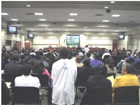
SHS students listen in as their charter petition is presented to the SCUSD board.