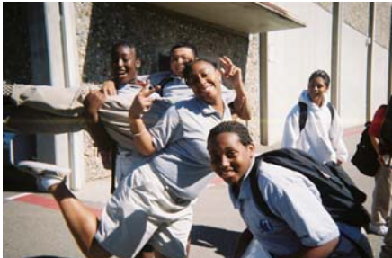
PS7 students enjoy their final days as 8 th graders before entering Sac High.

It's easy to be on top. At least it's been easy the last five years while PS7 expanded from a K-4 to a K-8 program as the first class of 8 th graders were the oldest group on campus for 5 years running. But now the tables have turned as 21 PS7 alumni enter Sac High as 9 th graders. Their four years at Sac High have started off strong, with most students earning a placement in geometry and all looking forward to access to the choices four small schools and a high school program rich with extra-curricular activities has to offer. Alumni were greeted at the end of the first day of school by their 8 th grade teachers to cement the connection between PS7 and Sac High. The most striking fact that shows PS7's success with our first class at Sac High occurs every day at dismissal, when several PS7 alumni walk over to the Middle School to tutor their peers from last year, complete community service hours, or just check-in with their teachers to