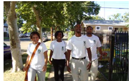
New Hood Corps class walks the street of Oak Park.